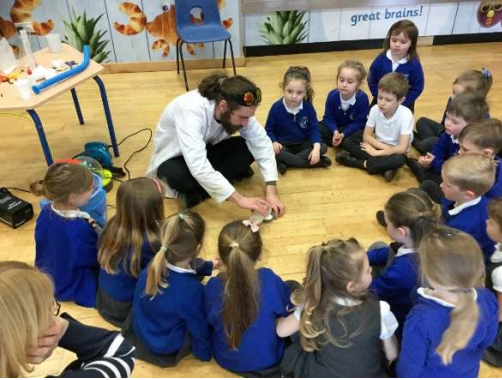
Science workshop- Sublime Science

During Science week, Class 1 have been learning about how blossom is appearing on trees now that it is Spring. The drawings they have produced following our Spring walk have been very creative and they have added blossom by printing with paint and adding collage with tissue paper. They have been measuring the Amaryllis they have watched growing from a bulb, as it has grown taller each day. After freezing toy people in ice last week, they explored how ice melted under various conditions using their own ideas and making their own predictions. Hands-on exploration with magnets has enabled the children to discover which things are attracted and which are not. The children have been considering why this may be. We have a lot of Dr Curious Superheroes!