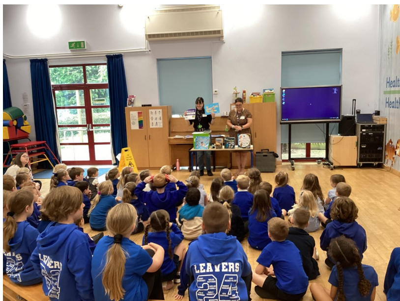
Photo of the Library Summer Reading Challenge Assembly